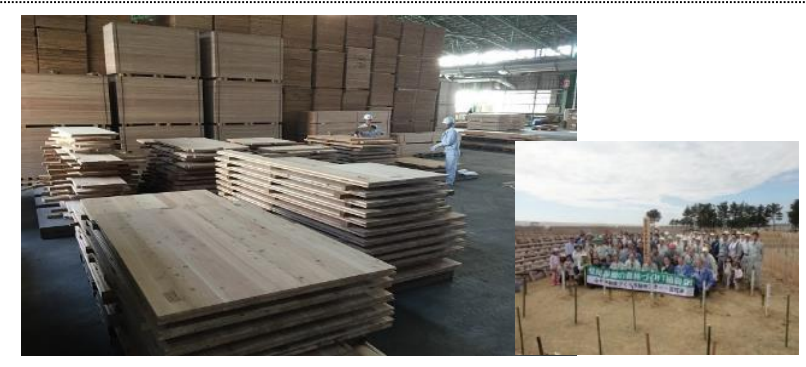
Example of a business entering a new field by making use of the Group Subsidies [Installation of CLT (cross laminated timber) production line ]

Miyagi Prefecture worked with the national government to make use of the "Measures to Support Facility Reconstruction for Small and Medium-sized Businesses and other Groups" (Group Subsidies) to provide support for early restoration of production infrastructures at disaster-affected businesses.