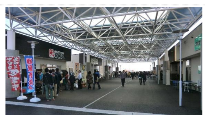
Nigiwai-kairo shopping street at Arahama, Watari Town. This facility was built using Group Subsidies.