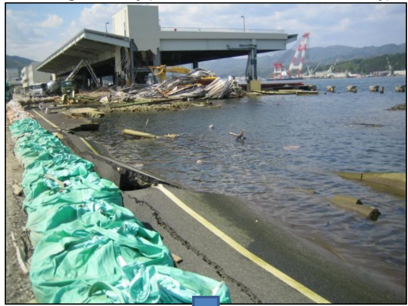
Fishing Industry (Fish market in Kesennuma City)