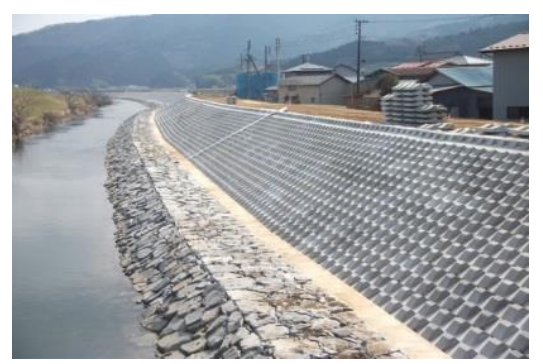
State of reconstruction work on Kojirahama Shore (Matsushima Town)

Affected: 280 sites Completed: 254 sites