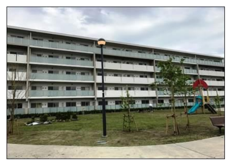
Disaster Public Housing (Yuriage, Natori City)

Completed building all disaster public housing in the end of March, 2018 (15,823 units)