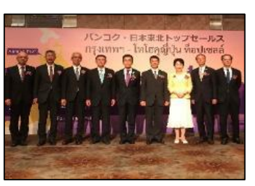
Tourist PR event by "Bangkok Top-sales Promotion Project"

The Miyagi Prefectural Government is taking steps to attract more foreign tourists by collaborating with the region's various tourism organizations and the Tohoku region as a whole. We hope that by doing so we can rid the area of the stigma that resulted from the 2011 Great East Japan Earthquake disaster and the Fukushima nuclear power plant incident.