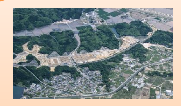
Construction carried out in hills of northern Nobiru (Higashi-Matsushima City)

No. of areas where construction has commenced: 12