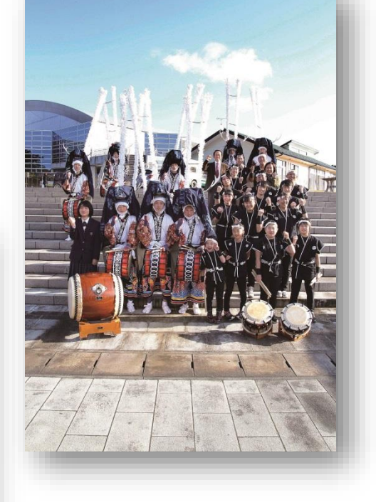
Miyagi Prefecture November 11, 2020